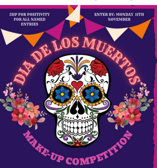
SEND A MAXIMUM OF TWO PHOTOS OF YOUR MAKE-UP SKILLS IN CELEBRATION OF DIA DE LOS MUERTOS (DAY OF THE DEAD FESTUAL -A MEXICAN TRADITION COMMEMORATING THE DECEASED AND CELEBRATE THEIR MEMORY)

NAME YOUR PHOTOS WITH YOUR SURNAME AND FORM - FOR Y11, ADD YOUR HOUSE TOO. UPLOAD THEM TO DIA DE LOS MUERTOS MAKE UP COMPETITION