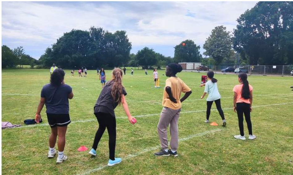
Above - sports workshops were organised by Cheam Cricket Club, Sutton and Epsom RFC, Sutton United FC and Cheam Hockey Club

While parents enjoyed refreshments and revisited the uniform sale, the children enthusiastically participated in games such as rugby, cricket, hockey, and football. The event concluded with a brief speech from the headteacher and PTA representatives, highlighting the PTA's activities, encouraging new parents to join PTA, and discussing the importance of the 200 club.