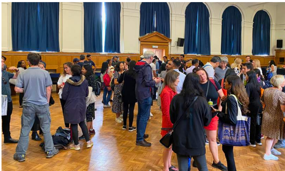
Above - Year 7 Parents and Carers mixed with each other in the main school hall and in the Quad area when it stopped raining